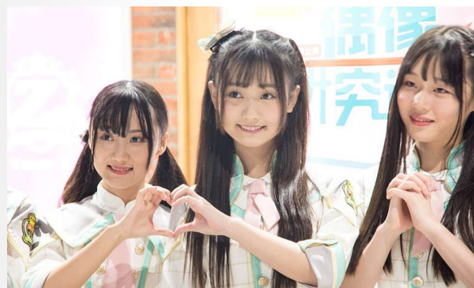
@ GNZ 48 Theater located in Zhongtai International Plaza, Guangzhou

GNZ48 is a Chinese pop-idol girl group formed in 2016 with their exclusive theater located in Tianhe, Guangzhou. "GNZ" is the abbreviation of "Guangzhou". However, "48" does not represent a membership of 48. The group currently has 57 members who are divided into three teams. Their regular performances are for the most part by each group in turn, and just 16 individuals can perform at each time.